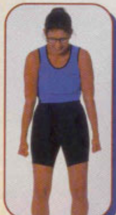
F - Ct. 2