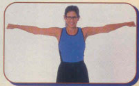
D - Ct. 4