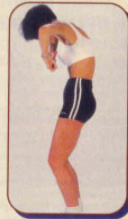
Side view form check

Form check: Notice how much the elbows are forward and at shoulder height. Also, thumbs point toward armpits.