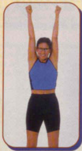
E - Ct. 2