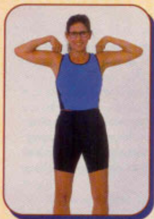
B - Ct. 1 & Ct. 3