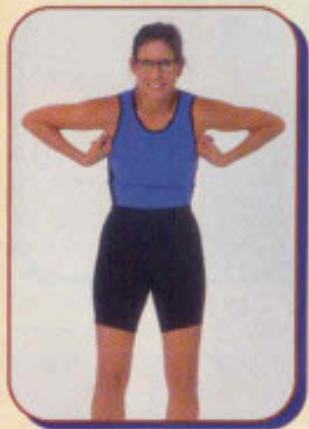
C - Ct. 1

Curl your fists in toward the top of the shoulders (deltoid). Be sure to keep your elbows up with no movement between the elbow and shoulder. Flex your arm muscles at the top of the movement. Extend back out to the starting position. Repeat for a total of 10. Turn your fists to face the floor while arms are extended and begin "reverse arm curl." Don't stop!