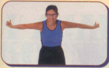
a - Start position Ct. 2