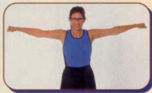
D - Ct. 2