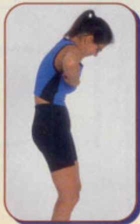
C - Side view elbows forward