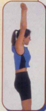
E - Side View