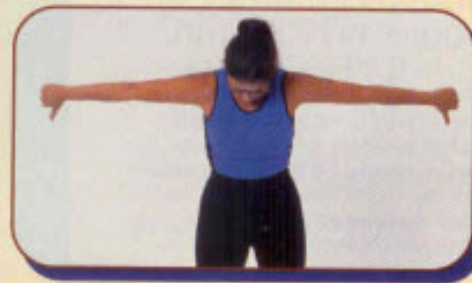
e - Ct. 3