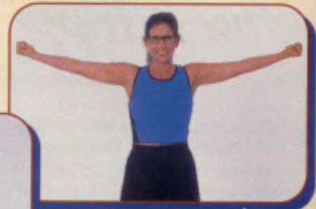
A - Ct. 4