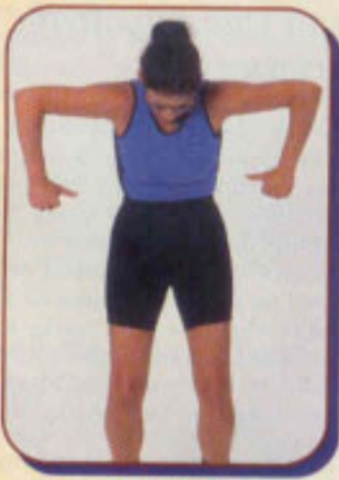
d - Ct. 1

Return your arms to your sides (ct 2). Extend them straight out from the side of the body with elbows locked and at shoulder height with thumbs pointing toward the floor (ct 3) then return arms to your sides, (ct 4). Repeat for a total of 10. Don't forget to stretch afterwards.