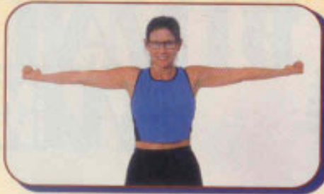
b - Ct. 1