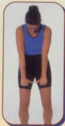
c - Ct. 2 & 4

To be a future reader/model: mail pictures and success story to: T. Tapp, 1450 10th Street South, Safety Harbor, Florida 34695.